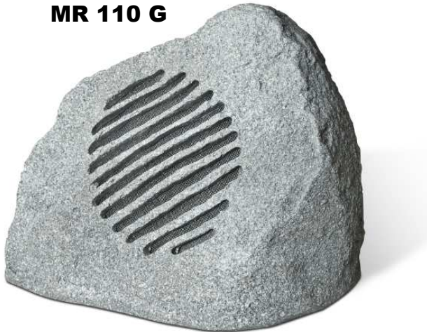
MR 110 G